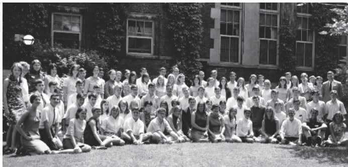
QLF Summer Staff Orientation, Montréal, Québec, 1967~