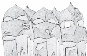
Roof terraces La Padrera, Barcelona ~

Two decades ago, the German Marshall Fund of the U.S. asked QLF to include Catalonia in land stewardship exchanges. In recent years QLF has continued to advise its Catalan Alumni. They have enthusiastically maintained their connection with each other and QLF to pursue nature stewardship, especially of privately protected areas. To date, 175 individuals have expressed interest in attending, and QLF is seeking support of program Sponsors at levels of $10,000 and up.