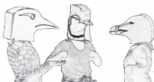
Interns engage youth in Seabird Conservation ~

They will tackle the worldwide issue of marine debris from a community-based perspective, working with fish harvesters to develop ways to reduce plastic debris, remove derelict gear, and cultivate stewardship of the ocean.