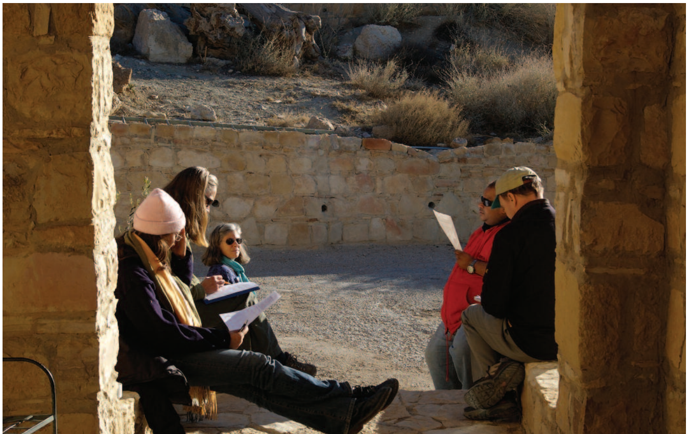
Capacity and Consensus Building Workshop (2008). Participants in a small group session, Dana Nature Reserve, Jordan