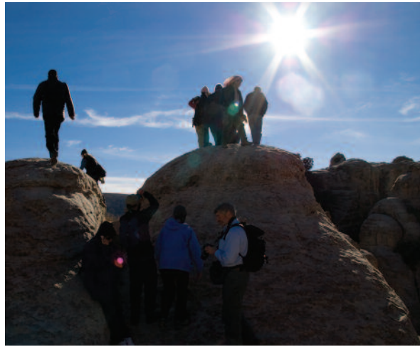
Fellows hiking in the Dana Nature Reserve, Jordan, on break during the Capacity and Consensus Building Workshop (2008). Dana is managed by the Jordanian Royal Society for the Conservation of Nature.