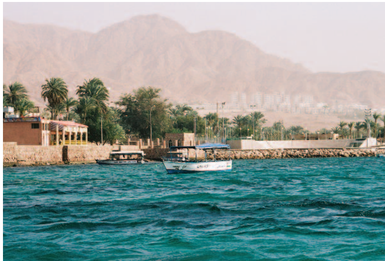
Gulf of Aqaba, Jordan. Aqaba is the only port in the Kingdom with direct access to the Red Sea and strategically located at the intersection of Jordan, Israel, Egypt, and Saudi Arabia (2007).