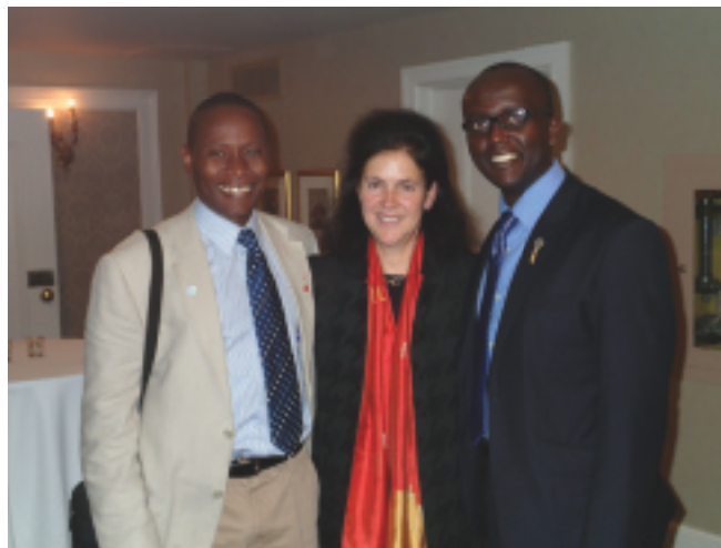
With friends at BirdLife International Meeting, Ottawa, 2013 -

Soon after I arrived at QLF, we began to receive substantial funding to "share QLF's model globally" — now enshrined in our mission statement. Donors have continued to be interested in seeing us test our programming approaches and methodologies developed in the Atlantic Region, in other places around the world.