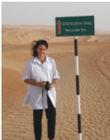
Desert field trip, Middle East Regional Meeting, Oman, 2012 -