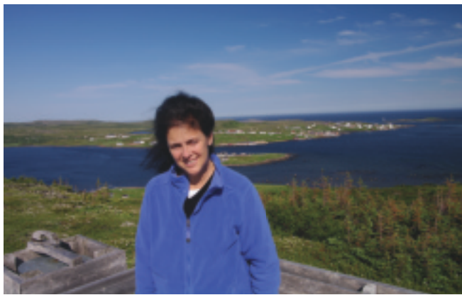
Putting on a good face amidst swarming black flies, Red Bay, Labrador, 2014 -