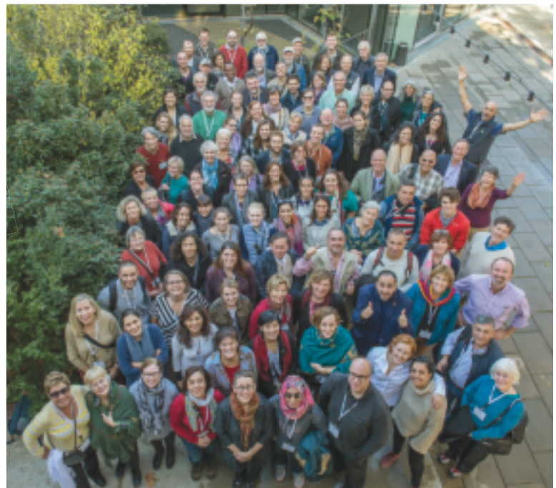
Alumni "flash mob," QLF Congress, Catalonia, Spain, 2016 -