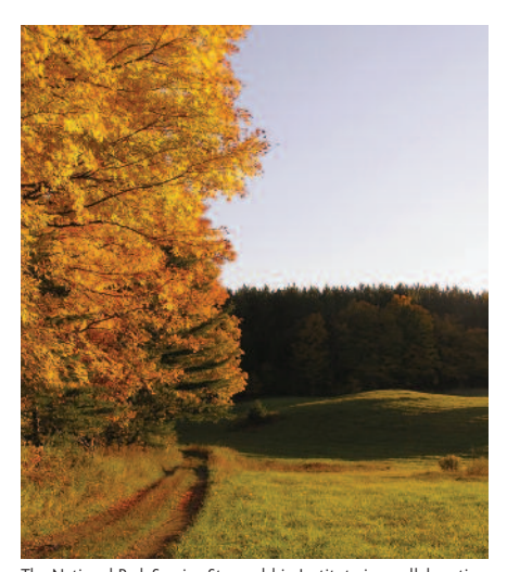
The National Park Service Stewardship Institute is a collaborative for change, from the way it is organized, to how it works. The origin of the Stewardship Institute is rooted in the idea that the National Park Service is an organization of great public purpose and that its people – charged with the stewardship of some of America's greatest treasures – need to be supported, challenged, and provided opportunities for renewal.

The Institute is itself a partnership, founded in 1998 by the National Park Service with the University of Vermont, Shelburne Farm, and QLF. It is also rooted in central Vermont. Being based at Marsh-Billings-Rockefeller helps keep the Institute grounded in the realities of park operations as it reaches out across the northeast region, the country and indeed internationally. And QLF is with them every step of the way.