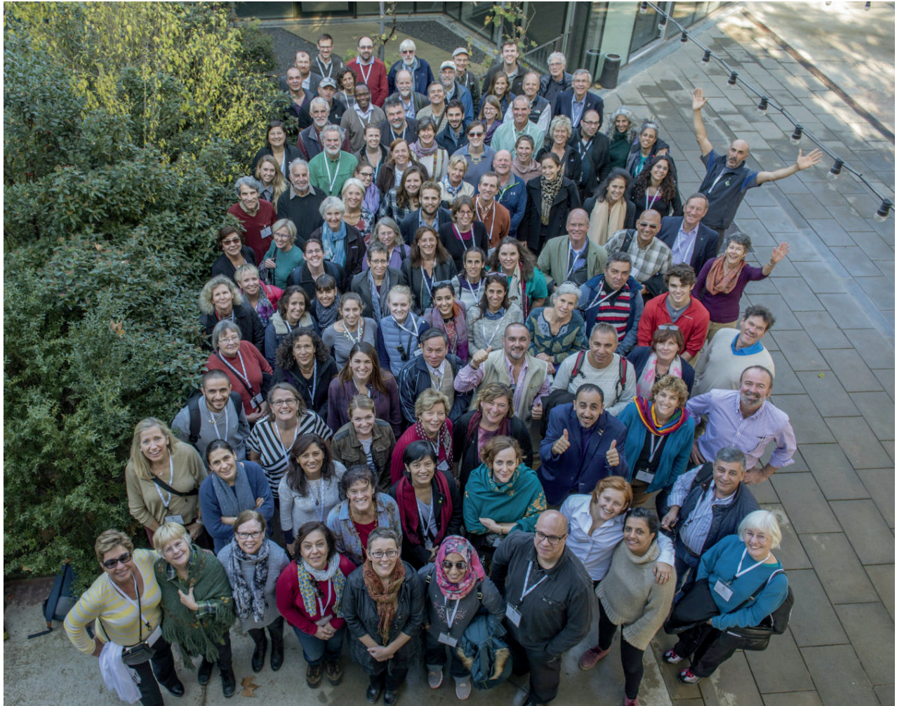
Closing day, QLF Congress, Món Sant Benet, Catalonia, November 2016