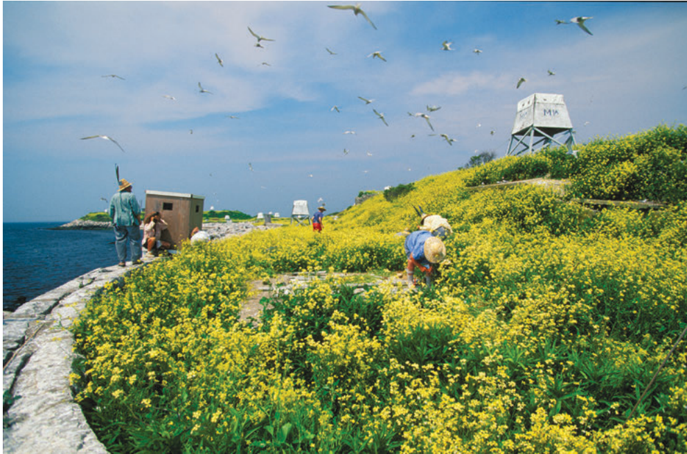
Great Gull Island is the largest nesting colony of Common and Roseate Terns in the Western Hemisphere. Common and Roseate Terns breed on Great Gull and migrate thousands of miles each fall to South America. The Great Gull Island Project of the American Museum of Natural History is the longest longitudinal study of Common and Roseate Terns in the Western Hemisphere. The Great Gull Island Project celebrates its 50th Anniversary in September 2018.

The Sounds Conservancy Marine Research Program ~ In 1995, QLF accepted The Sounds Conservancy Program with its endowed funds. The mission of The Sounds Conservancy is marine research, advocacy, and environmental education along the six Sounds and coastal waters of southern New England.