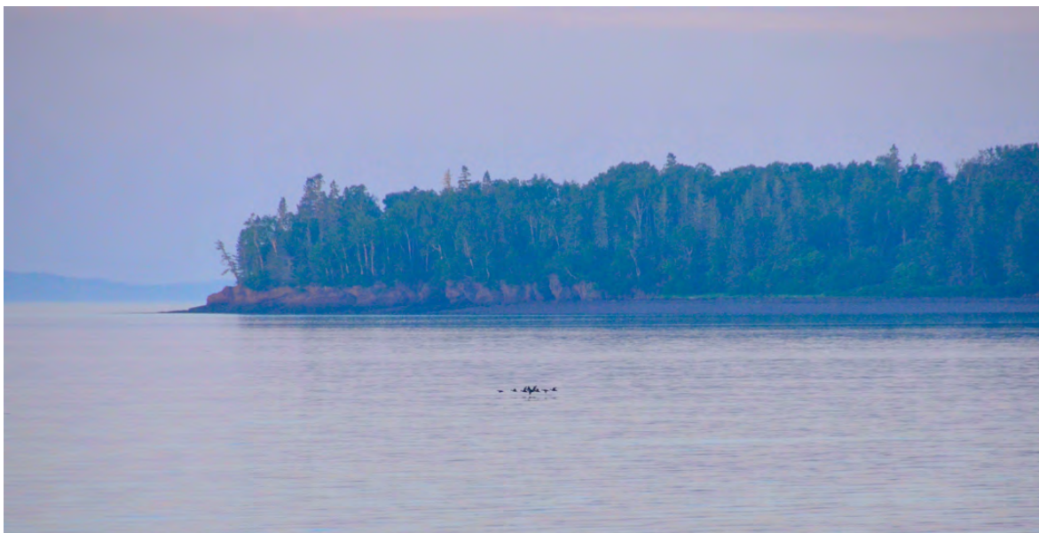
Looking out at the Bay of Fundy from the shoreline of Disher Conservation Easement in Bocabec, New Brunswick, an area of land protected by the Nature Trust of New Brunswick

On Prince Edward Island, the conservation team partnered for the first time with the Island Nature Trust (INT) and conducted nesting habitat surveys of the threatened bank swallow and endangered piping plover, which share PEI's coastal cliffs.