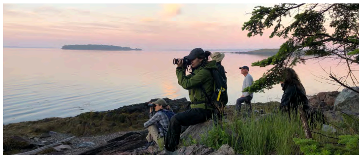
The QLF field team conduct a seabird survey on the coast of Disher Conservation Easement, in Bocabec, New Brunswick

In Nova Scotia, the team completed significant work in two priority areas identified by partner organization, the Nova Scotia Nature Trust (NSNT): mapping and stewardship tasks. The former took the form of digitally mapping selected nature preserves, which helps the NSNT keep close tabs on nature preserve's recovery and organize work parties as necessary.