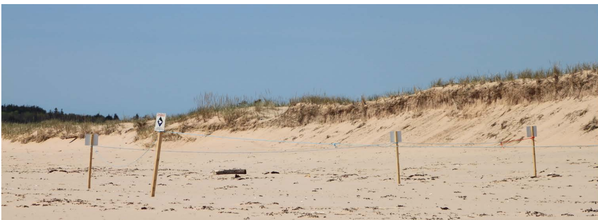
Bird nesting area, a focus of nesting habitat surveys of threatened and endangered species, Prince Edward Island

In all, QLF the conservation interns visited 31 different nature preserves, surveyed 11 beaches, and conducted 41 bird surveys, conducted 8 macro-invertebrate surveys at multiple sites per survey, and reached a total of 48 stewards and community members, many of whom joined the team multiple times.