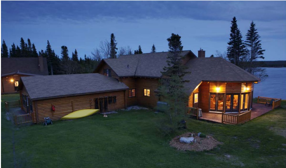
TUCKAMORE LODGE, MAIN BROOK, GREAT NORTHERN PENINSULA OF NEWFOUNDLAND

effectively opened doors for QLF throughout the region. In one early case, bush planes were used to ferry QLF Interns from Newfoundland to Labrador to deliver goods and participate in conservation activities.