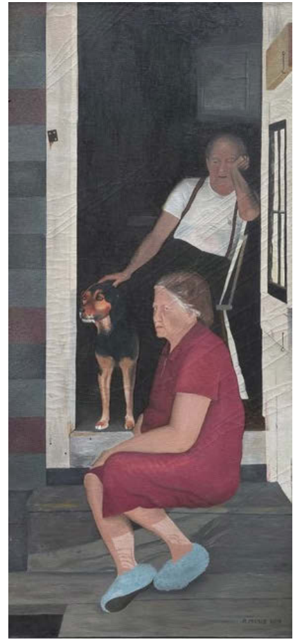
PAINTING BY ROSITA MOORE

Created in 1978, Rosita's painting captures a moment of time when the town was in decline – a town forgotten. Gone were the 17 sardine factories, movie theater and waterfront shops. Many stores and houses were empty. In Rosita's painting one senses the isolation and melancholy of the elderly couple sitting on their stoop in their quiet town on a summer afternoon.