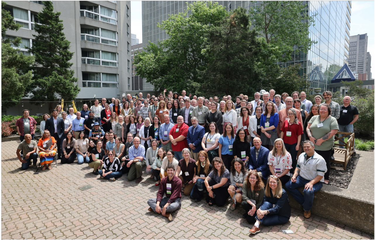
Summit participants gathered for a group photo on the final day of the gathering, in Montréal / Tiohtià:ke, Québec.

QLF co-hosted the Summit with the Center for Large Landscape Conservation (CLLC) on behalf of the Staying Connected Initiative (SCI) partnership. The gathering was a resounding success, with great energy, important outcomes, and strong interest in a second Summit. We look forward with excitement and enthusiasm to working with SCI partners to build on this momentum in the months and years ahead.