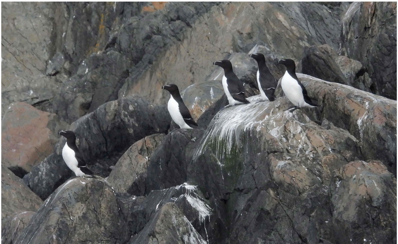
Razorbills breed on Spring Island (pictured), part of the Hare Bay Islands Ecological Reserve, and on Little Cormorandier Island, just north of the Fischot Islands.

Hare Bay is home to the Hare Bay Islands Ecological Reserve and the Important Bird Area of the Fischot Islands. Residents, including hunters, fishers, outfitters, tour guides, and entrepreneurs are passionate about the wildlife of Hare Bay and wish to see their traditional activities part of a sustainable management plan for the many islands and mainland habitats of the bay.